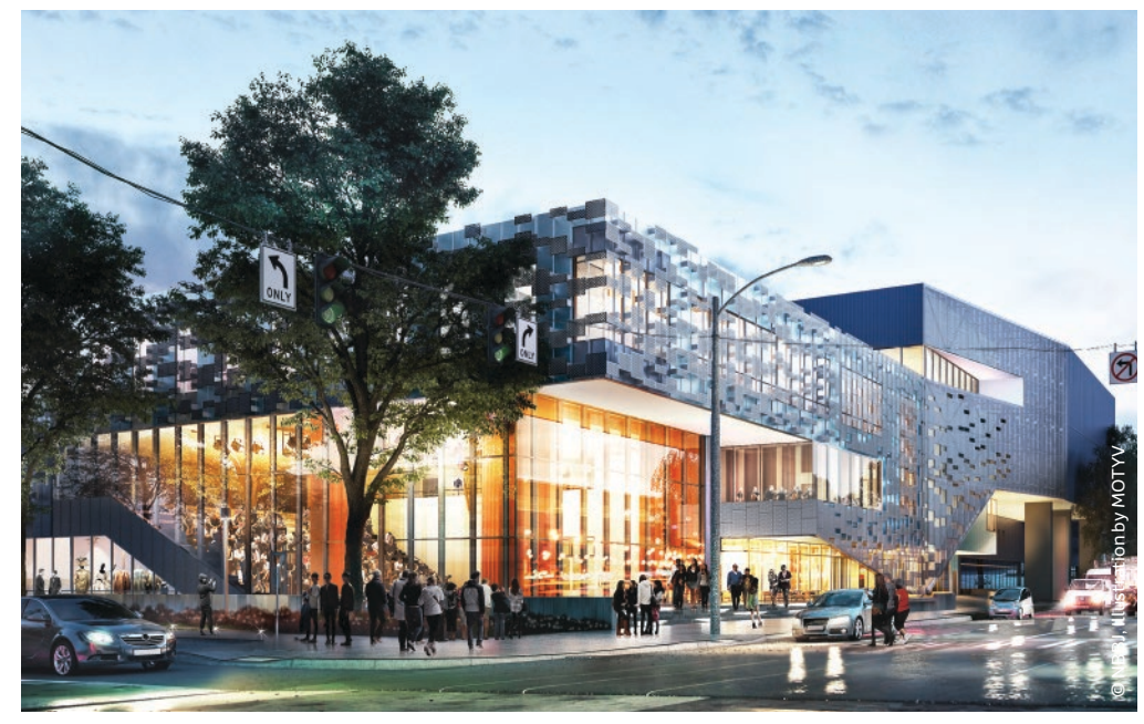
Exterior rendering of Seattle Opera's new civic home next to McCaw Hall.