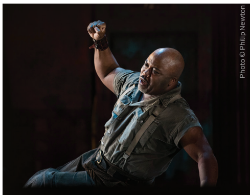
Porgy & Bess