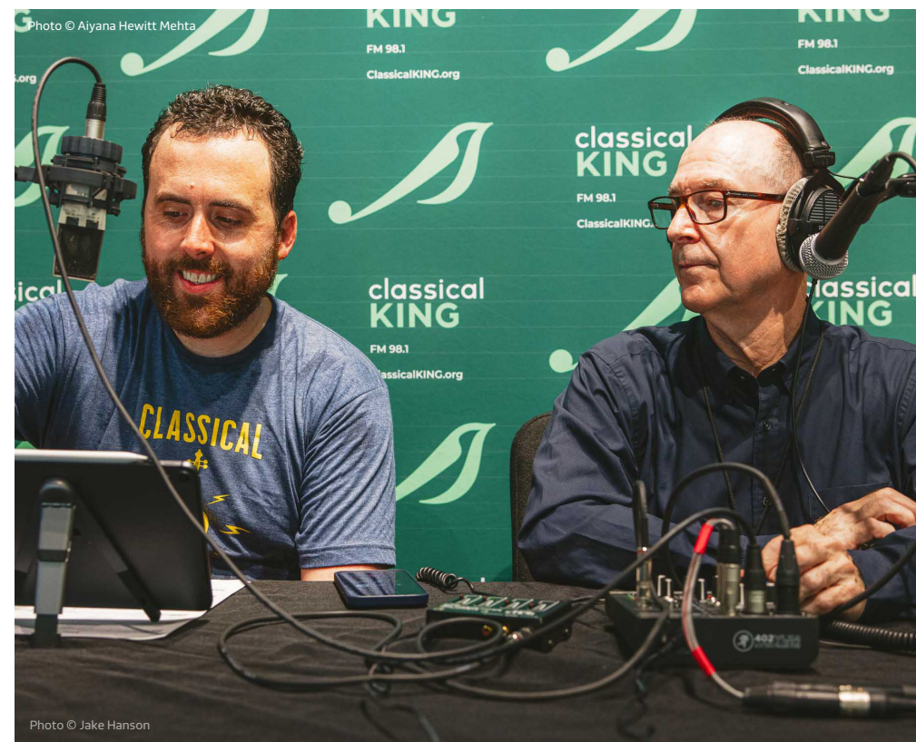
For many years, Classical KING FM 98.1 has been our partner. In addition to airing recordings of our mainstage productions, they have joined us in several community activities, such as our recent Opera Center Open House.