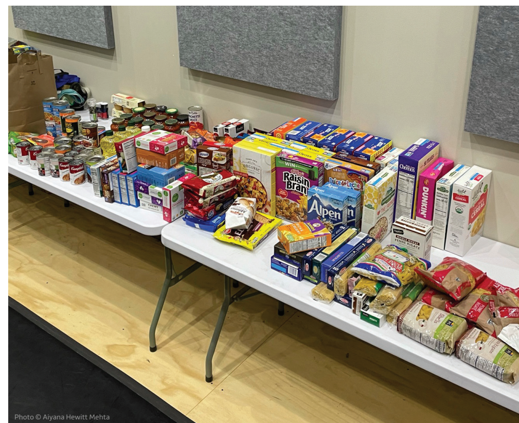
Being a good neighbor means offering a helping hand when needed. Working in partnership with the Refugee Women's Alliance, Refugee Artisan Initiative, and Jewish Family Service, your food donations during our run of Tristan and Isolde aided Afghan refugee families.