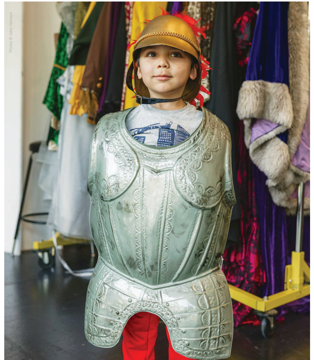
Visitors of all ages toured the costume shop. Some even got to try one on!