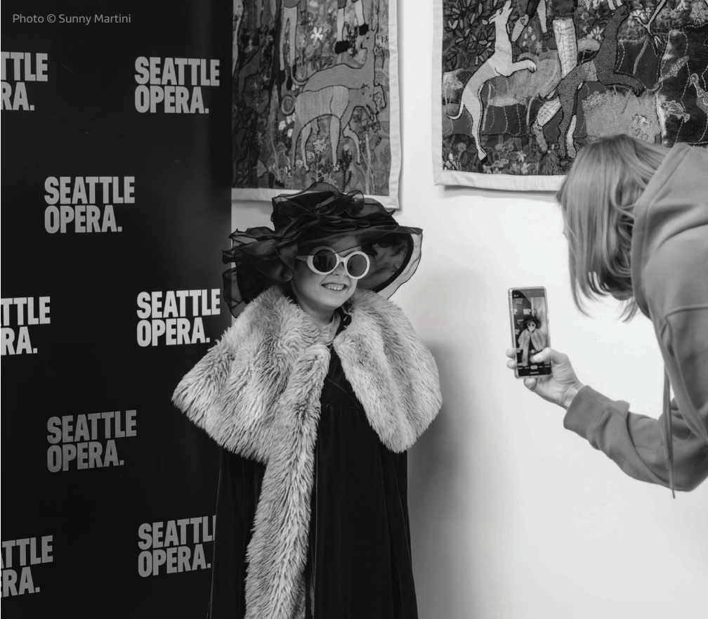
The fall Open House was an event of hands-on activities, including costume dress-up (top), a “kazoo-along of The Barber of Seville Overture (bottom left) and Props Department demonstrations (bottom right)..

The highlight of the day, however, was seeing the many faces of our community come together to celebrate art. Displays from community partners including Tasveer, Seattle Rep, Arte Noir, and Path with Art demonstrated the interconnectivity of Seattle's arts community. By opening our doors and sharing our work with our audiences, Seattle Opera renewed our commitment to creating top-quality art with and for our community. For there's nothing like a 200-voice sing-along to remind you of the power of community-building through art.