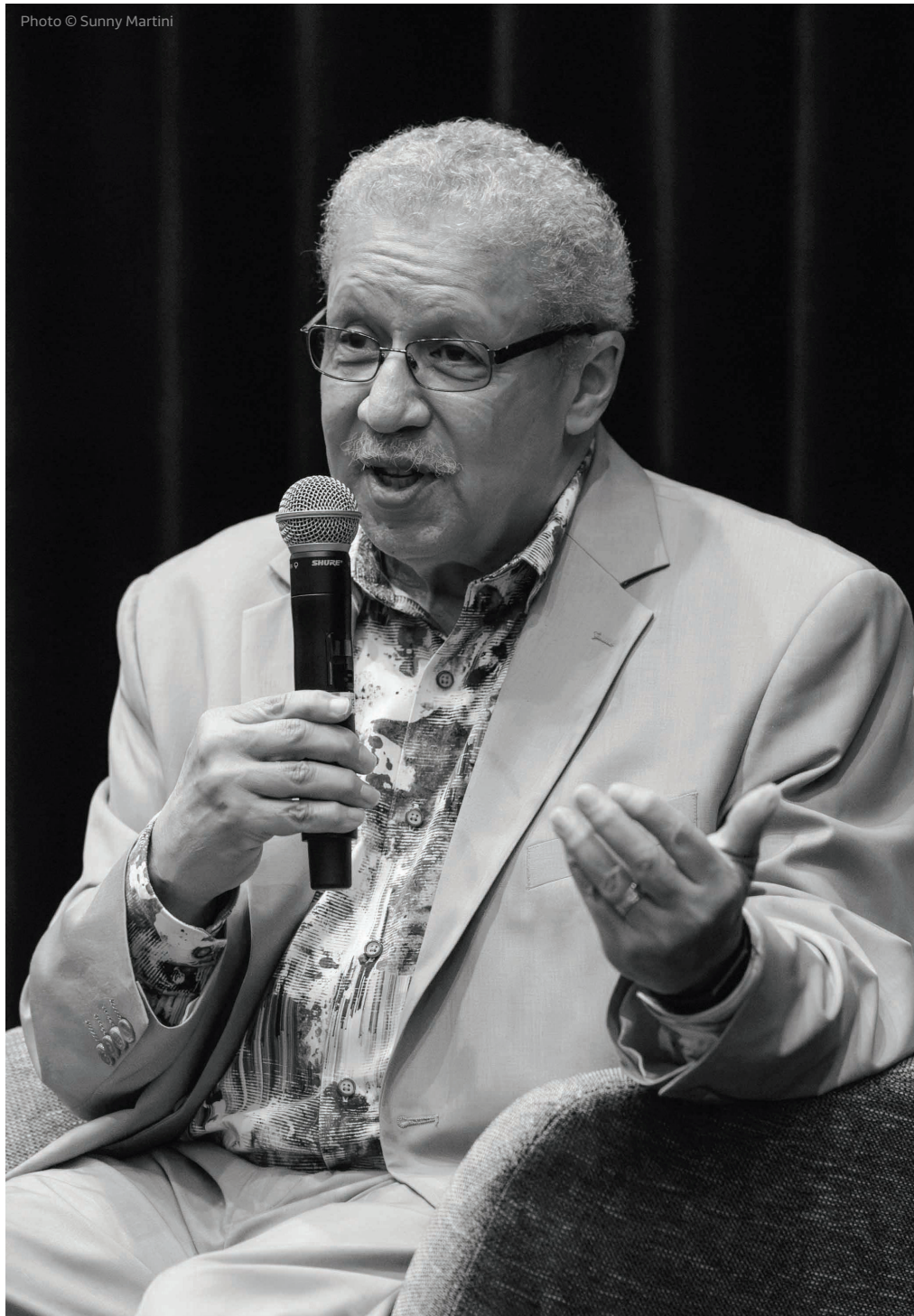
A Pulitzer Prize-winning composer, Anthony Davis discusses the creation of X: The Life and Times of Malcolm X .