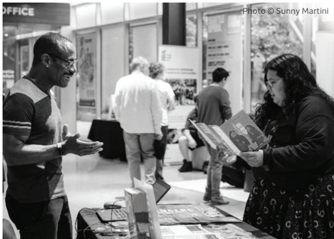
Staff and artists from Seattle Rep share information with visitors at our recent Open House in September.

Organizations both large and small have joined with us to enrich communities all over the state. In the last three years, Seattle Opera has worked hand in hand with partners like Sound Health, Path with Art, Classical KING, Jewish Family Service, Refugee Artisan Initiative, Casa Latina, and the Northwest African American Museum. More recent partners include Tasveer, ARTE NOIR, and Seattle Children's Theatre, to name just a few.