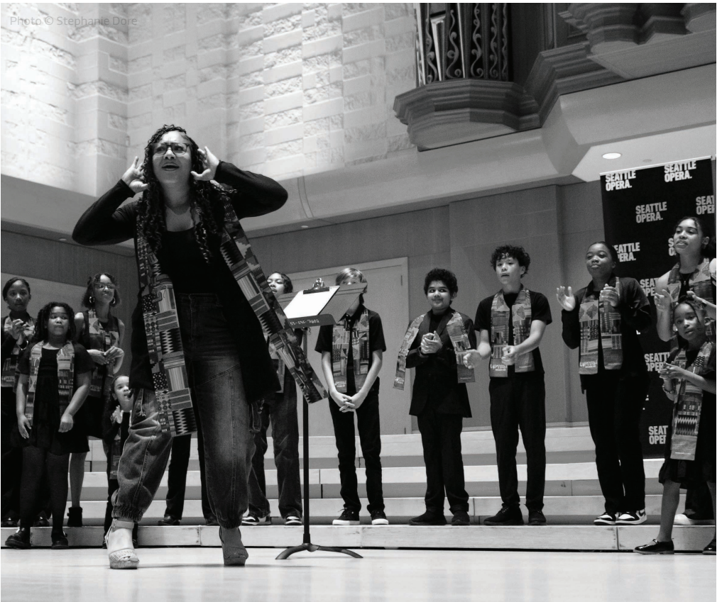
Lifted! Youth Gospel Choir, performed at Tacoma's Jubilee Day commemoration at Pacific Lutheran University.